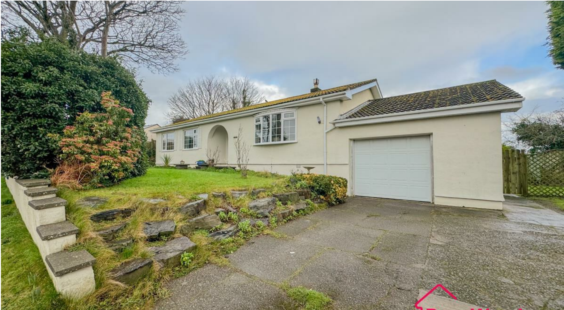
Poppy Fields Kiondroghad Road, Andreas, Isle Of Man, IM7 3EL £439,950